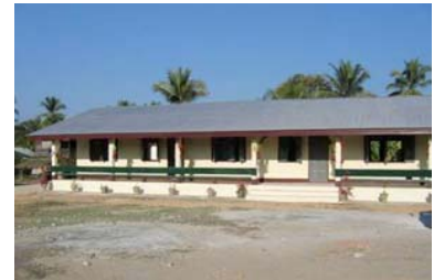
Shree Janakalyan Lower Secondary School, Dhadhing, Nepal expansion