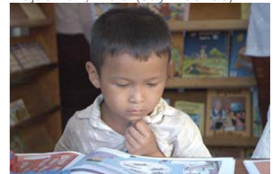
Young boy reading a book, Siem Reap, Cambodia