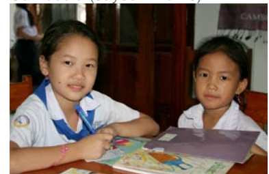
Laos girls reading at library, Vientiane (Stacey Warner)