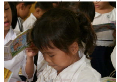
Vietnamese girl reading at library, Cu Chi, Vietnam (Stacey Warner)