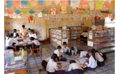
Library, Kampong Chhnang, Cambodia (Jayson Morris)

Name: Room to Read Functionality: Library and Reading Room Budget: approx 3,000 USD per library Funding: donations/grants