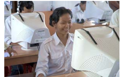
Girl using a computer lab to contribute to the global community and improve her life situation.

Name: Room to Read Functionality: Stand-alone children’s library Budget: approx 10,000 USD per library constructed Funding: donations/grants