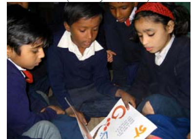
Curious children at a library, Rajasthan, India