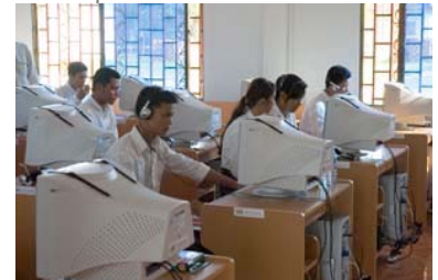
Computer lab in Battambang, Cambodia with room for 4,000+ at Net Yang Secondary School