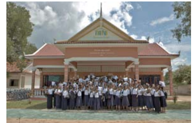
Room to Grow Scholars in front of 2000th Library, Siem Reap, Cambodia (Dustin Frazier)

Name: Room to Read Functionality: Stand-alone children’s library Budget: approx 10,000 USD per library constructed Funding: donations/grants