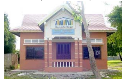
Teuk Thlar Primary and Junior High School, Banteay Meanchey, Cambodia