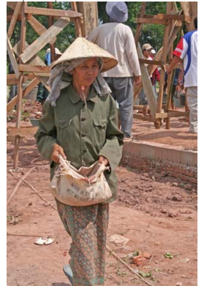
Laos woman carries materials as part of challenge grant (Stacey Warner)