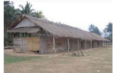
Typical inadequate school in rural areas.

Name: Room to Read Functionality: Children's school Budget: approx 15,000-35,000 USD per school Funding: donations/grants