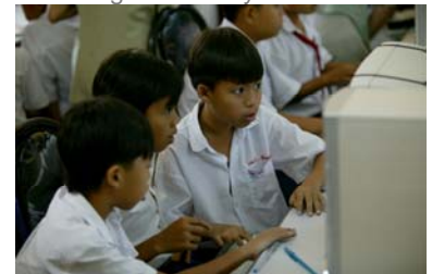
Students learning at Vietnam computer lab, Tien Hoc Le, Vietnam (Rob Poor)