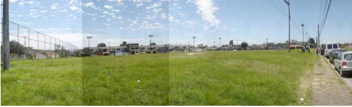
Site looking North