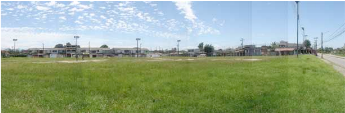
Site looking North