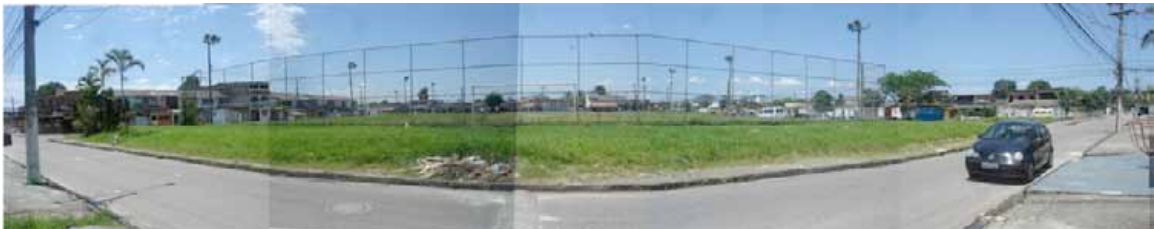
Site looking East