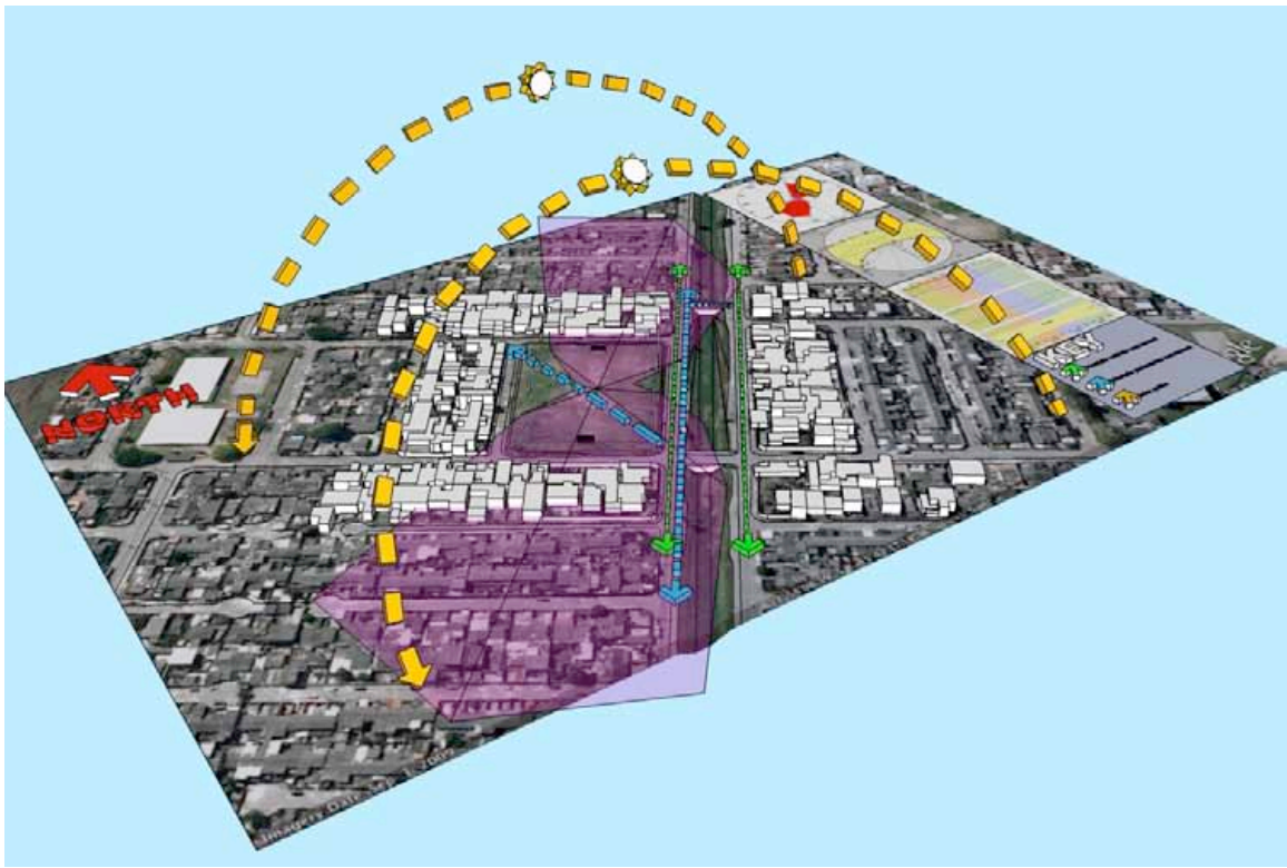
From SketchUp File